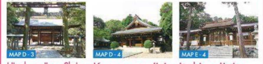
Hinokumajingu Shrine 日南神社 Kunikakasujingu Shrine 國屋神社 Kamayama Jinja Shrine 龍山神社 Itakiso Jinja Shrine 伊太祁曽神社

日南神社・國屋神社と龍山神社、そして伊太祁曽神社の三社を詣る「西国三社参り」は西日本領南と言われ、古くから多くの人々が参りに訪れます。