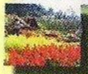
COLD PLACE FLOWER GARDEN