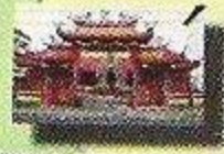
BETONG FOUNDATION BUILDING