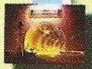
BETONG MONOKOL RIT TUNNEL