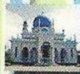
THE CENTRAL MOSQUE