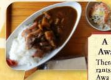
A local specialty! Awa Odori chicken

A secret spot for viewing cherry blossoms and tulips.